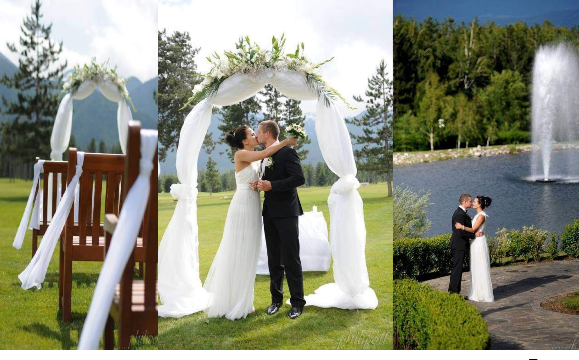
GET MARRIED ON A GOLF COURSE?